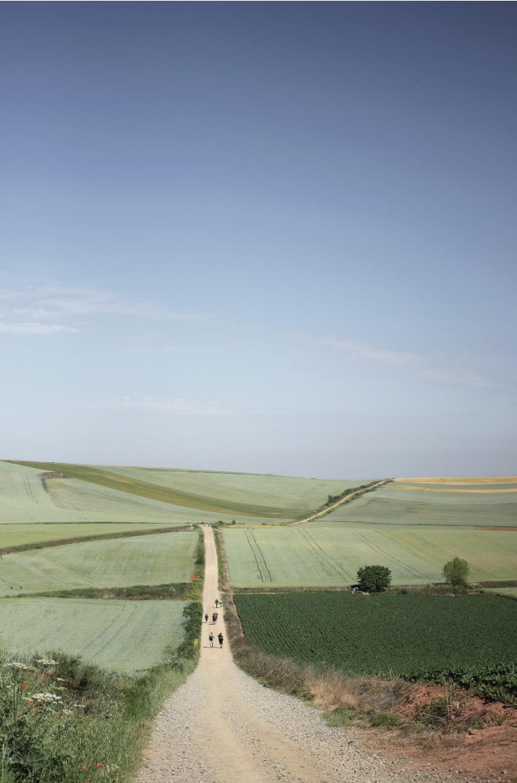
Les routes sans fins

The Lord had said to Abram, "Go from your country, your people and your father's household to the land I will show you. Genesis 12:1